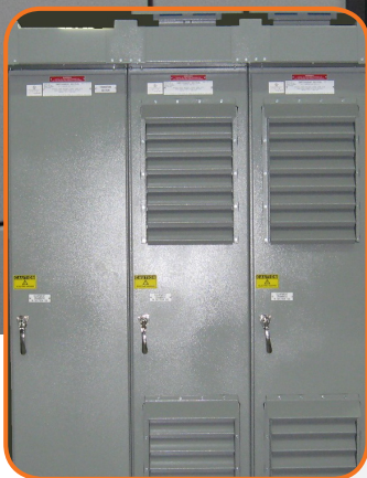
3R NON WALK-IN